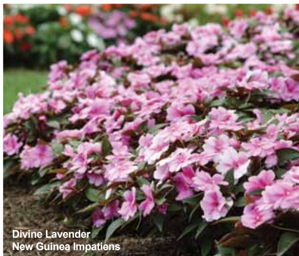
Divine Lavender New Guinea Impatiens

New Guinea Impatiens Don't worry... we're not affected by Impatiens Downy Mildew!