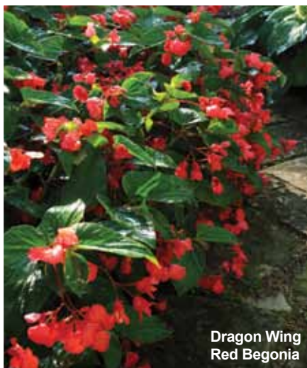
Dragon Wing Red Begonia